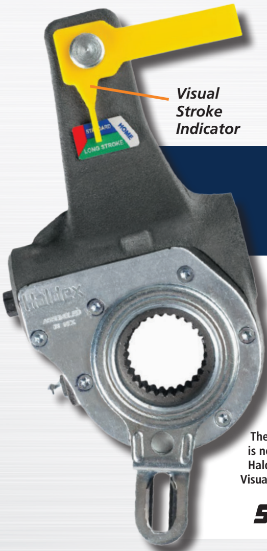
Visual Stroke Indicator